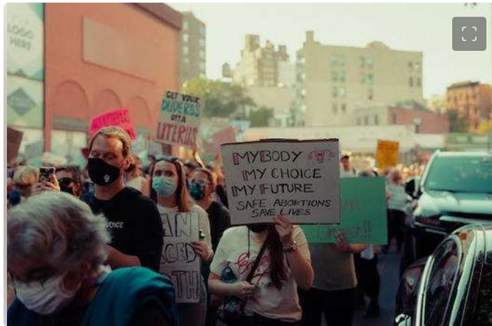
📌 The Secretary of State has determined Floridians Protecting Freedom has received the requisite number and distribution of valid signatures to obtain a spot on the ballot for a proposed amendment in the 2024 General Election.

Florida voters will soon have the opportunity to express their views on abortion rights at the ballot box.